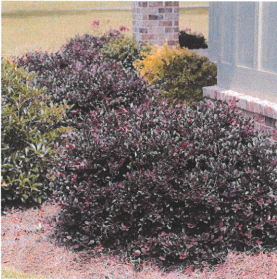
Purple Daydream Loropetalum