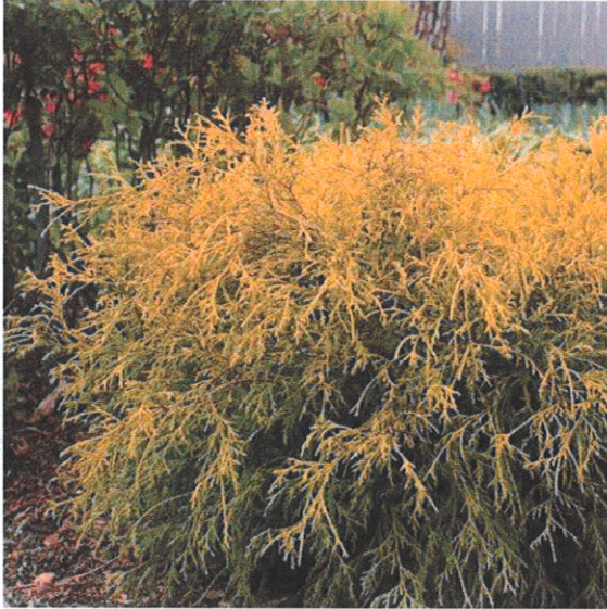
Gold Mop Cypress