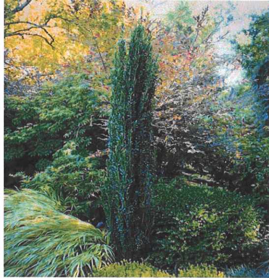
Sky Pencil Holly